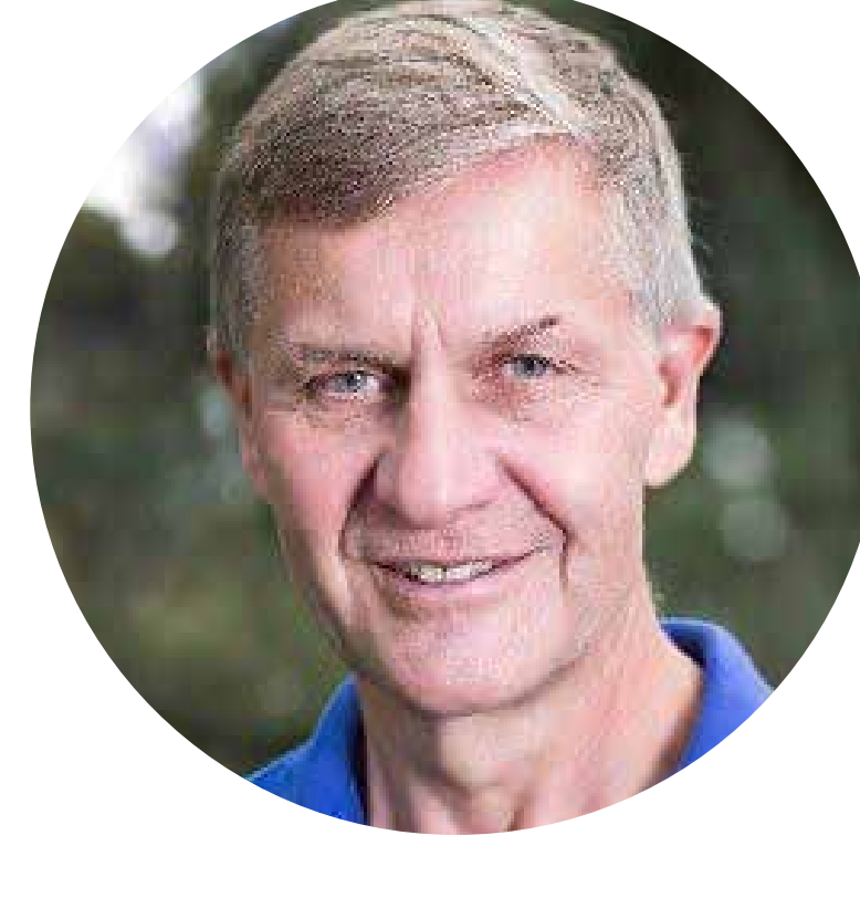
Shri Erik Solheim The 6 th & former UN Environment Executive Director & Under-Secretary General of the UN