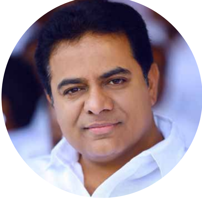
Shri K.T. Rama Rao (Hon. Minister for IT, I&C, MA&UD, Govt. of Telangana)