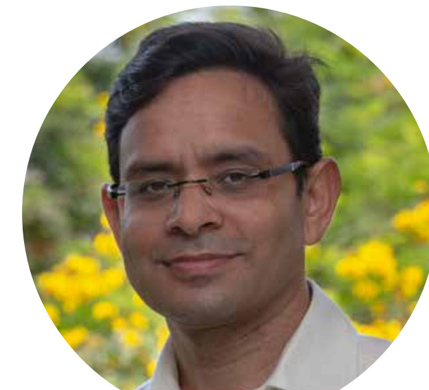
Prof. IIT Bombay Prof, IIT Bombay